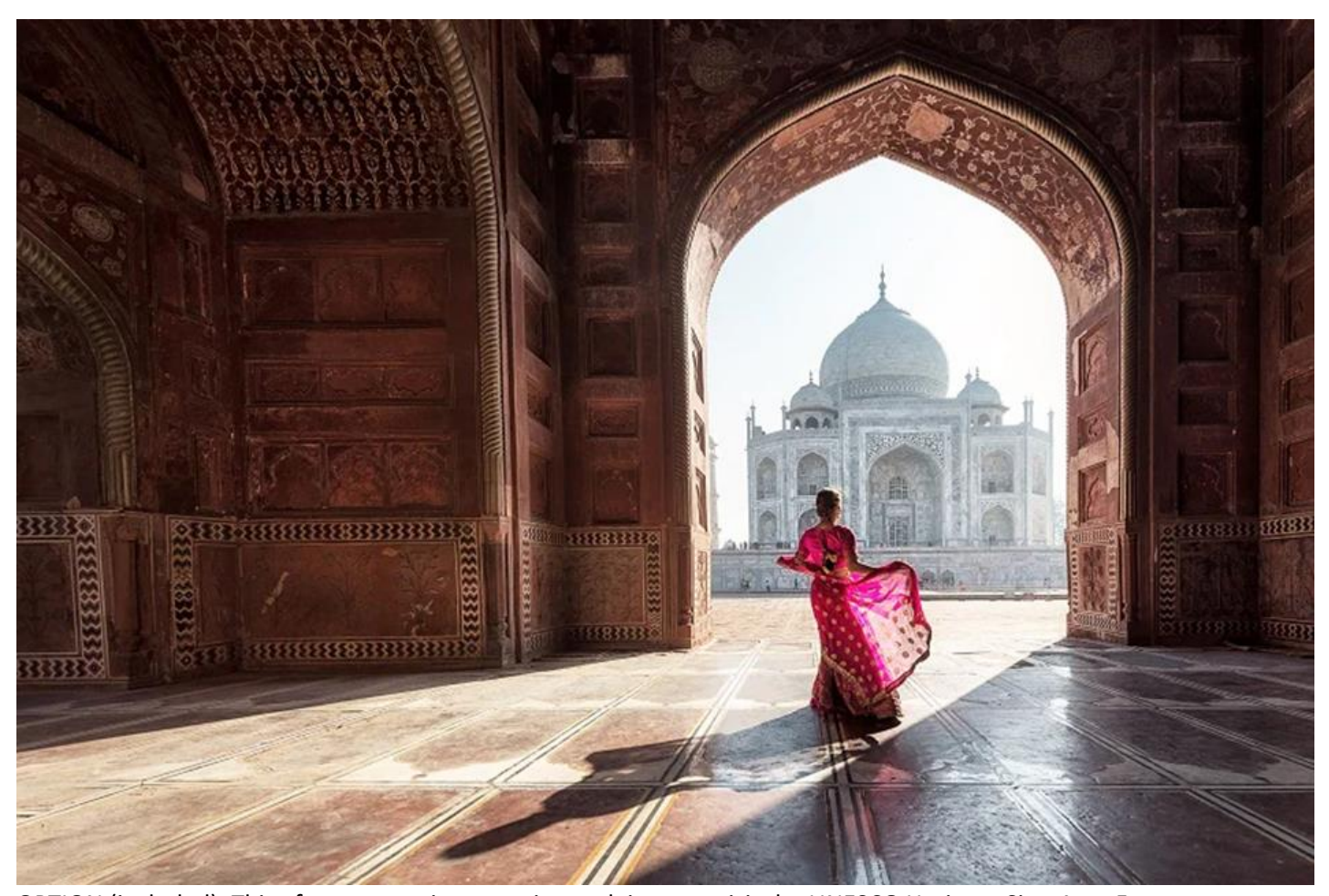
OPTION (included): This afternoon, enjoy your time at leisure or visit the UNESCO Heritage Site, Agra Fort.

The Taj Mahal changes colors with the seasons and the different times of day. At dawn, the marble has a delicate bloom in shell pink, by noon it glitters majestically white, turning to a soft pearly gray at dusk, and in the dark of night it shimmers against the backdrop of star-spangled sky. The many faces of The Taj Mahal display the seductive power of architecture at its best.