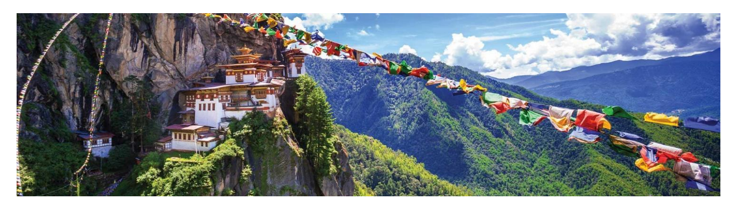
Day 1: November 11, 2024- Arrive Delhi, India

Upon arrival in India, meet your driver at the airport and transfer to your hotel.